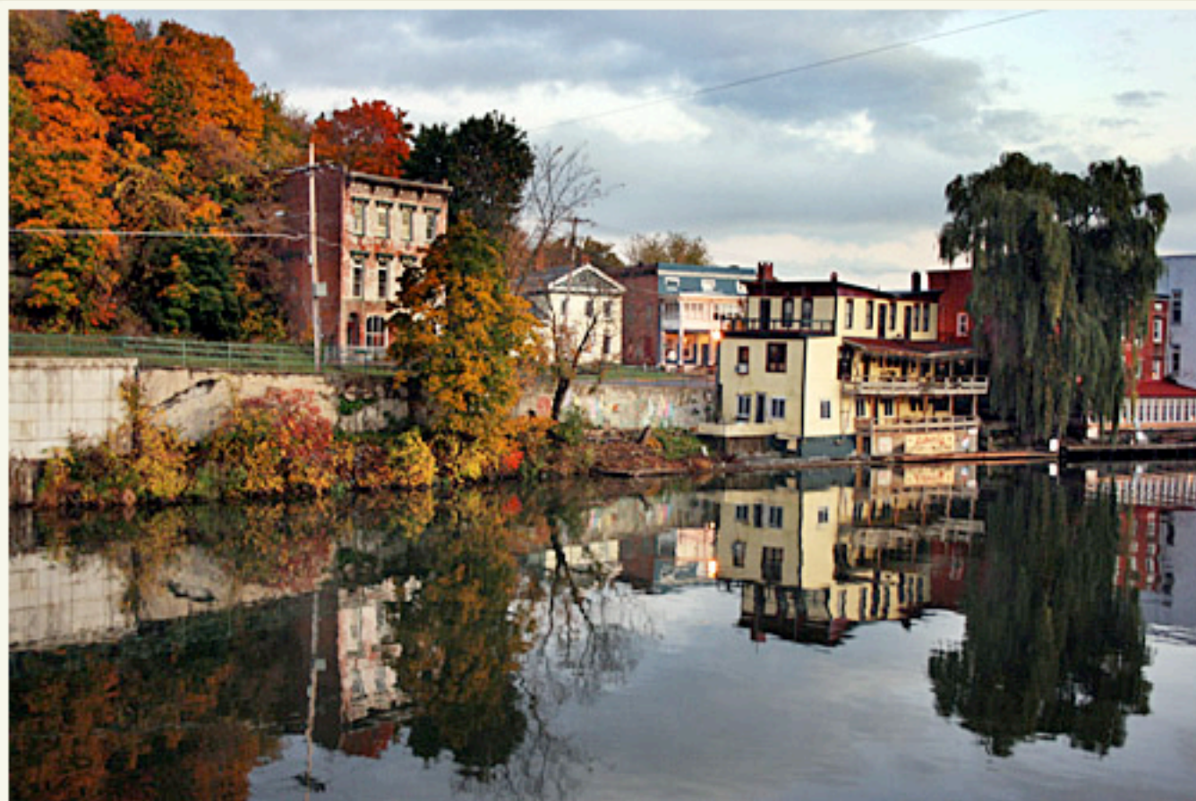
The village of Whitehall runs along the banks of the Champlain Canal

constructed during the summer of 1776 at what is today the village of Whitehall , using trees cut from the local forests. Carpenters, riggers, and blacksmiths were imported from as far away as Massachusetts, Rhode Island, Connecticut, and Philadelphia to build the ships.