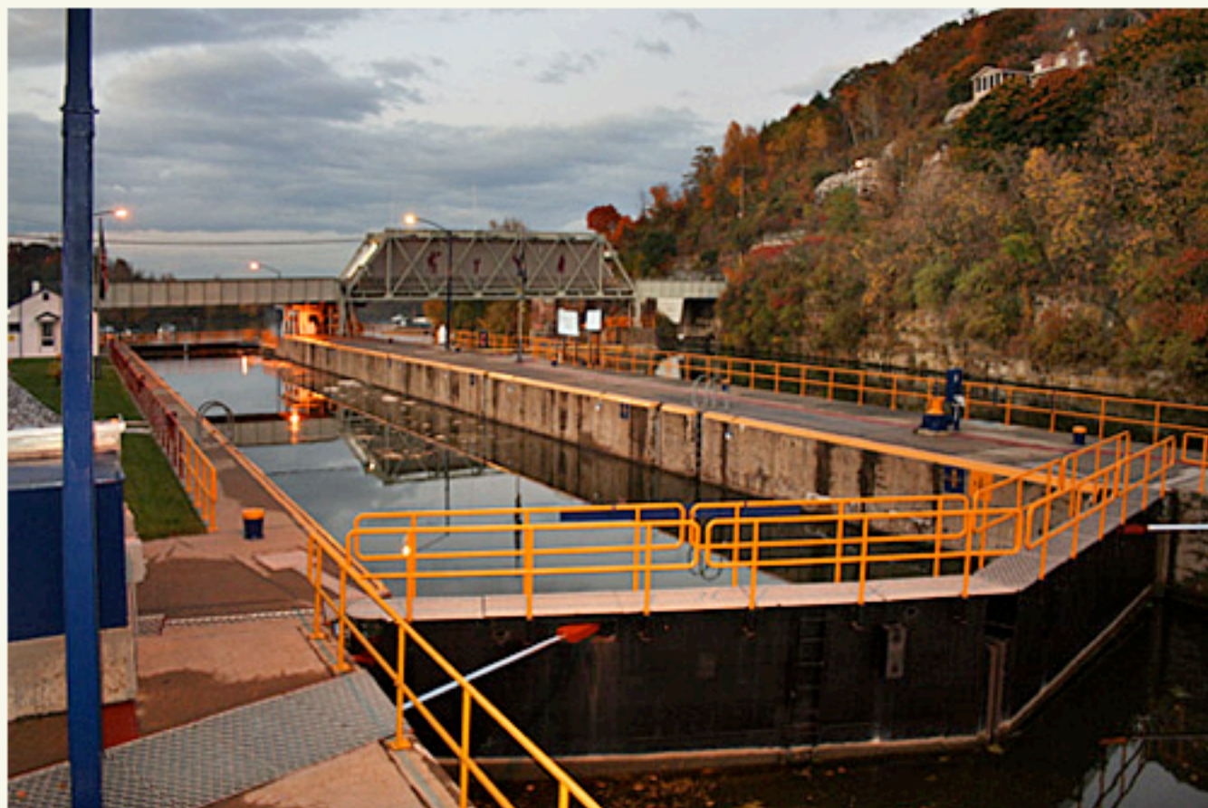
Lock 12 of the Champlain Canal, located in the center of town, is the entryway to Lake Champlain

Because Valcour was the first naval battle of strategic importance during the Revolutionary War, the New York State Legislature, in 1960, declared Whitehall to be the Birthplace of the United States Navy. Today this sleepy little village, nestled in a valley at the southern tip of Lake Champlain, attracts visitors as much for its scenery as for its history. Cruises regularly pass through Lock 12 of the Champlain Canal and sail onto the Lake, passing historic sites such as Fort Ticonderoga and Mount Independence, while enjoying abundant sightings of Eagles, Osprey, and Heron.