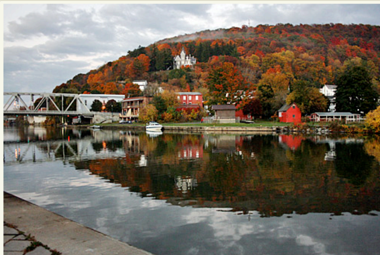
Skene Manor, an historical Victorian gothic style mansion, perches on the hillside, overlooking Lake Champlain and the village of Whitehall