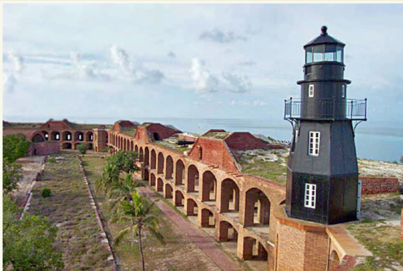
Visitors to Garden Key can also tour of historic Fort Jefferson

Within two years, piracy had been eliminated, but the Dry Tortugas once again became an important military site during the Civil War, as it allowed the Union government to blockade shipping and cut off supply lines to Confederate Troops. Since then, the Dry Tortugas have led a gentler existence. No longer used for military purposes, the islands were designated a National Monument in 1935 and received full National Park status in 1992.