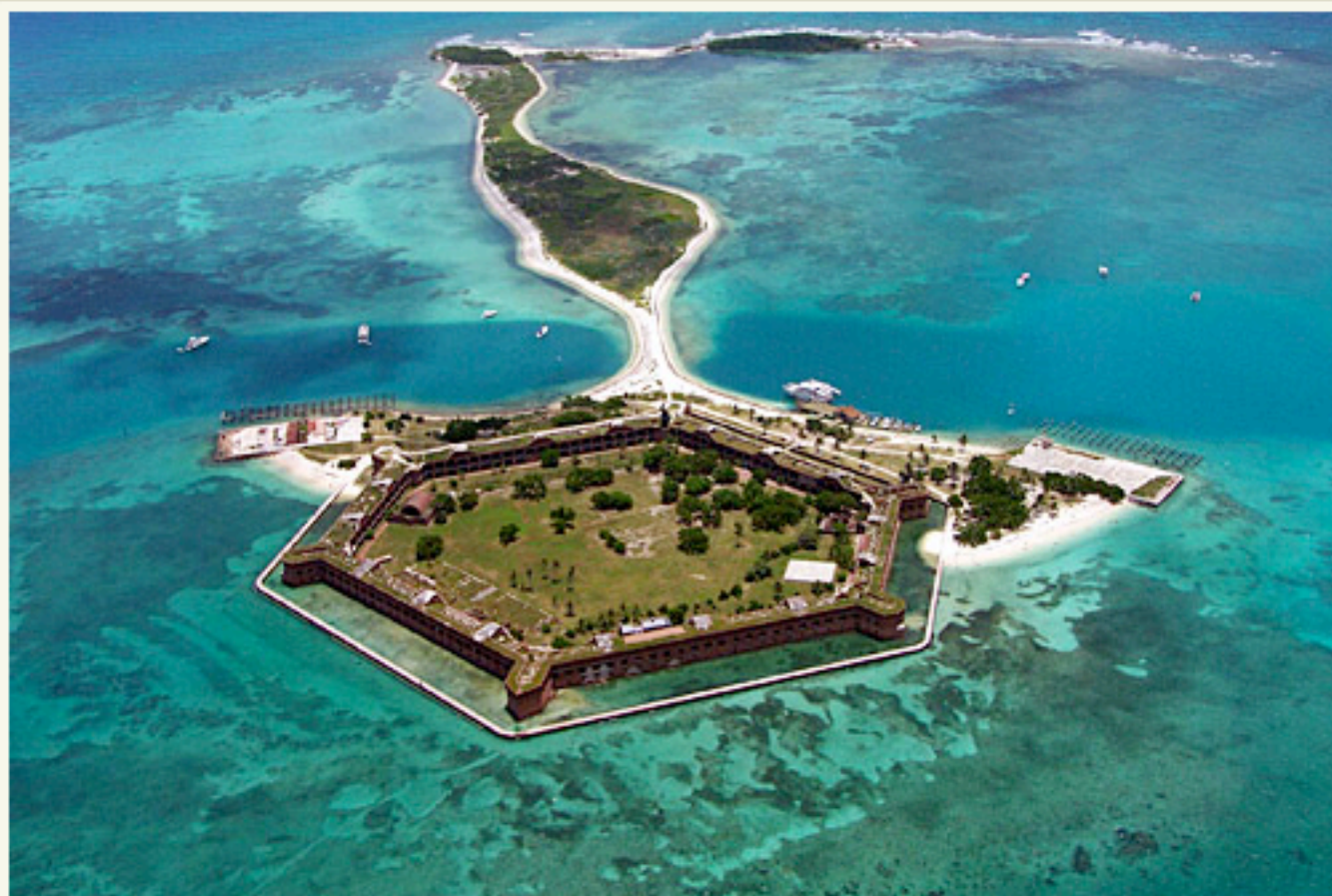
Aerial view of Garden Key and Fort Jefferson

In addition to fascinating history, the islands offer pristine white sand beaches, crystal clear shallow waters ideal for snorkeling, nature trails, and some of the finest birdwatching in the country. Other than private boats, the only access is via two fast ferries that leave daily from Key West , allowing visitors a 4.5 hour stay on Garden Key. Six primitive campsites are available, although campers are limited to one night's stay and advance reservations are required. There are no public phones, restrooms, or snack bars here. Even cell phones are useless. All waste must be hauled out and the only available water is from cisterns that catch rainwater. Though difficult to reach, Dry Tortugas National Park rewards visitors with an unforgettable experience that makes the trip well worth the effort.