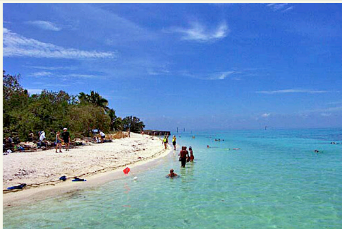
Beach at garden Key, the largest of the seven islands in the Dry Tortugas

The Dry Tortugas have been an important landmark for passing ships since they were discovered by Spanish explorer Juan Ponce de León in 1513. He named the islands Las Tortugas (the turtles) for the abundant sea turtles found in the area. The word Dry was later added to indicate that no source of fresh water was available. The islands were largely forgotten and uninhabited until pirates arrived in the 1800's, which forced the government to take steps to protect the shipping lanes. Five giant forts were planned - four on tiny Key West and a fifth, Fort Jefferson, was to be constructed on Garden Key, the largest island in the Tortugas chain.